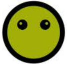
ROVER BADGE (INVESTITURE)