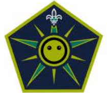
CHIEF SCOUT AWARD (ROVER SCOUTS)

Rover Scouts may also wear the Gaisce (Presidents Award) or Duke of Edinburgh award pin