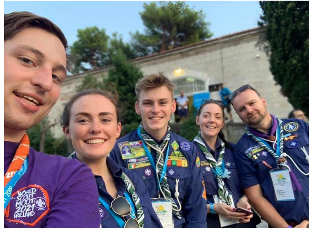
Photo shows the Irish delegation to the European Scout Conference in Croatia